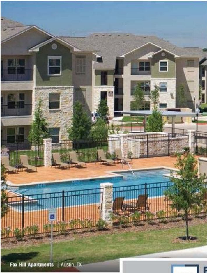
Fox Hill Apartments | Austin, TX