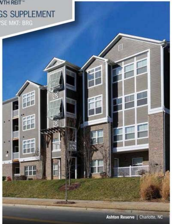
Ashton Reserve | Charlotte, NC